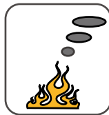
Low Smoke Emission IEC 61034-1&2 EN 50268-1&2/NF C32-073