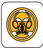
Low Toxicity NES 02-713/NF C 20-454