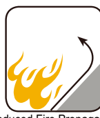
Reduced Fire Propagation NF C32-070-2.2(C1) IEC60332-3-24 EN50266-2-4