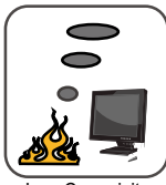
Low Corrosivity IEC60754-2 EN50267-2-2/3 NF C 32-074