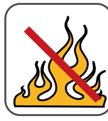
Flame Retardancy NF C32-070-2.1(C2) IEC60332-1-2/EN50265-2-1